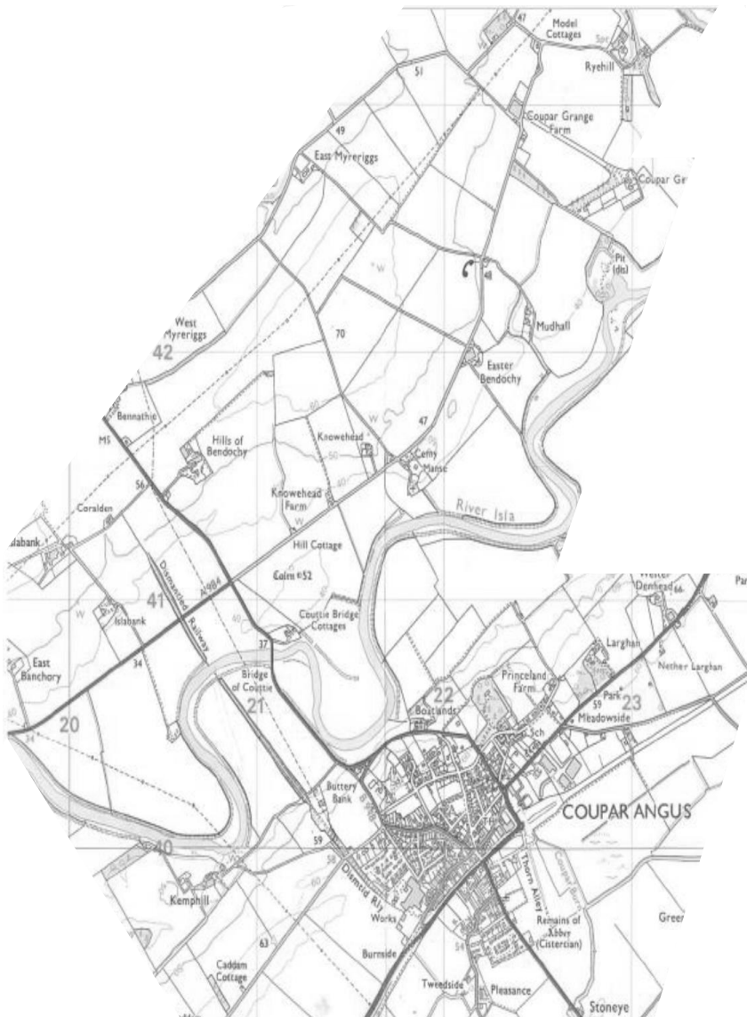
Front Cover – Scotland OS Map 1892-1960

Bendochy Parish Church of Scoland ((SC004358) and Coupar Angus Abbey Church of Scotland (SC014438) are component elements of the Presbytery of Dunkeld and Meigle (SC036630) which is itself a component element of the Church of Scotland (SC011353).