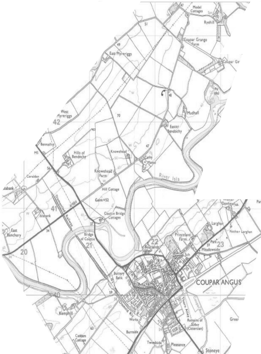
Front Cover – Scotland OS Map 1892-1960

Bendochy Parish Church of Scoland ((SC004358) and Coupar Angus Abbey Church of Scotland (SC014438) are component elements of the Presbytery of Dunkeld and Meigle (SC036630) which is itself a component element of the Church of Scotland (SC011353).